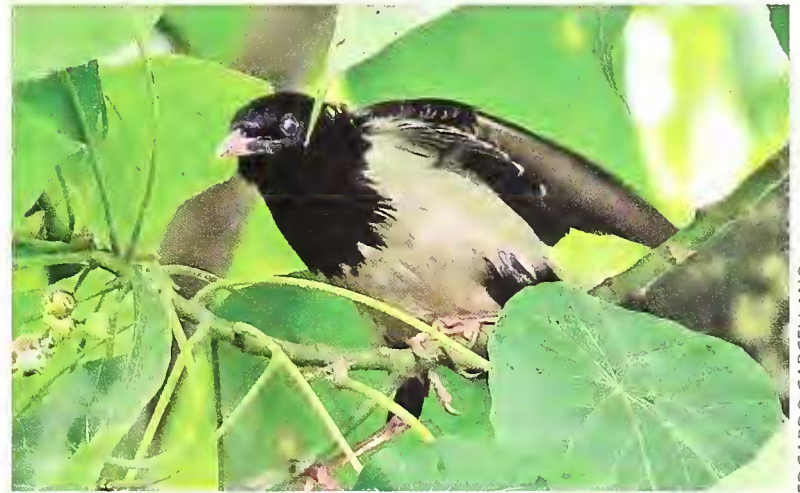
Plate 14. Adult Rosy Starling Pastor roseus , Banca-Bancao, Puerto Princesa, Palawan, 26 June 2012.